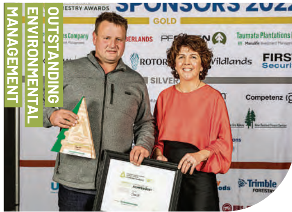
CREW 14 LOGGABULL