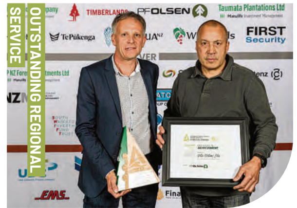
RITZ (RETINA) ELLIS ELLIS FORESTRY TRAINING & ASSESSING LTD