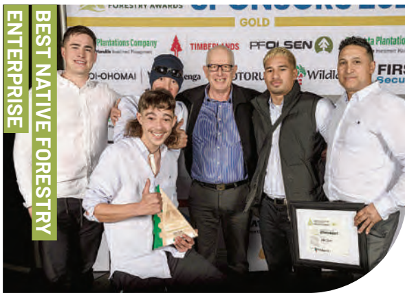
WAA OWENS TE WAA LOGGING