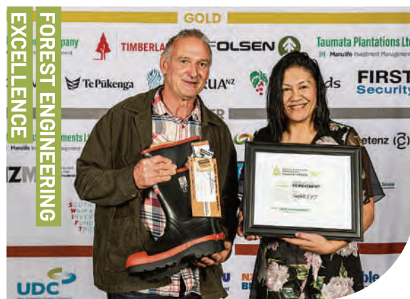
CAMPBELL & RJ J SWAP LTD