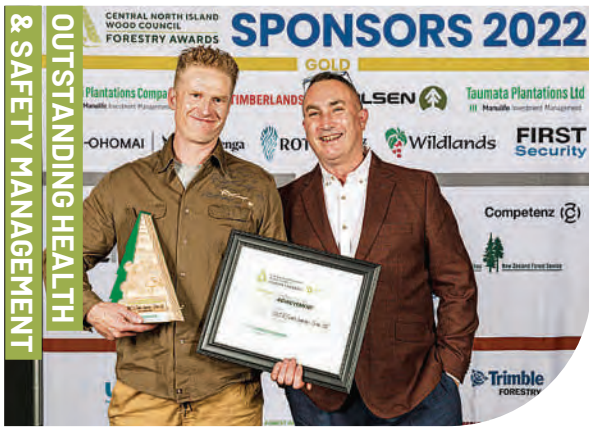
FAST & EVANS LOGGING - CREW 26 FAST HARVESTING